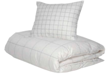
Stitch Anthra king duvet , R3 500, and pillow case , R500, both Hästens