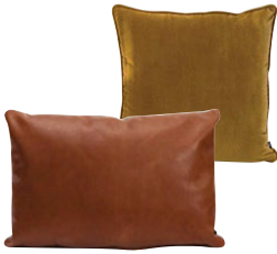
From left Lux pillow , R1 399, and Posh pillow , R450, both sofacompany.com