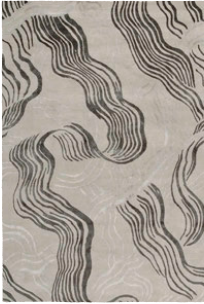
Wake rug by Kelly Wearstler, from R35 085, The Rug Company