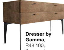
Dresser by Gamma, R48 100, Casarredo